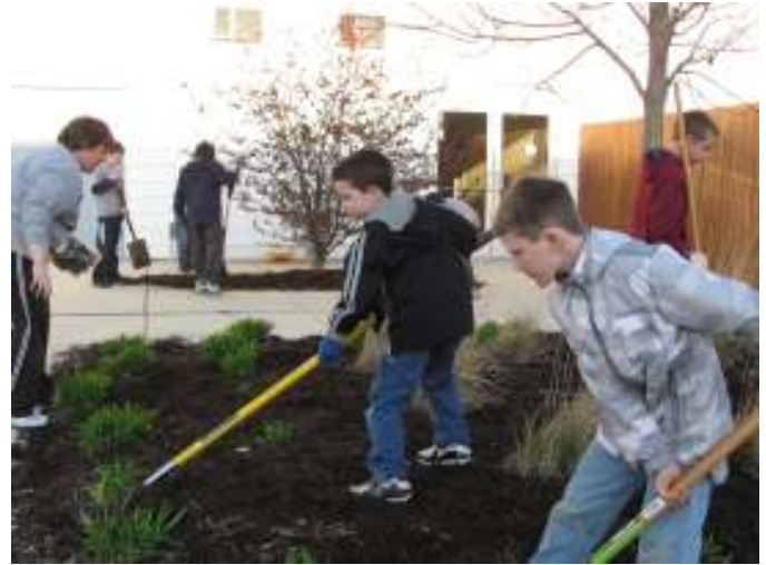
Scouts in action

Pack 84 celebrated Earth Day 2009 by beautifying the grounds at the Highpoint Community Christian Church, our chartering organization. A small army of scouts, along with friends and family members, spread fresh mulch on the flower beds, pulled weeds, and generally gave the grounds a good spring cleaning. This was a good opportunity for Pack 84 to show our appreciation of the sponsorship of our pack by the church.