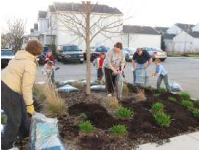
A few of the over 100 bags of mulch are spread

Submitted By Jon Harper, Newsletter Editor